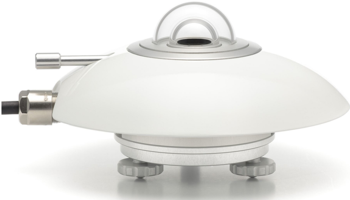
Figure 1 SR20 secondary standard pyranometer

SR20 is a solar radiation sensor of the highest category in the ISO 9060 classification system: secondary standard. SR20 pyranometer should be used where the highest measurement accuracy is required.