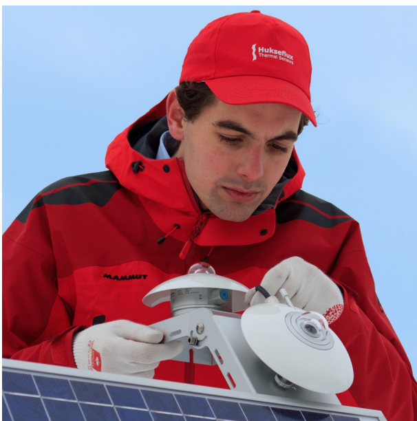
Figure 2 dual setup in PV system performance monitoring