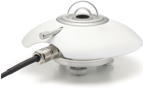
Figure 5 SR20 side view