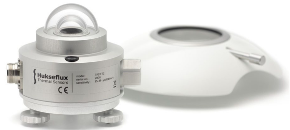
Figure 4 SR20 with its sun screen removed

The uncertainty of a measurement under outdoor conditions depends on many factors. Guidelines for uncertainty evaluation according to the "Guide to Expression of Uncertainty in Measurement" (GUM) can be found in our manuals. We provide spreadsheets to assist in the process of uncertainty evaluation of your measurement.